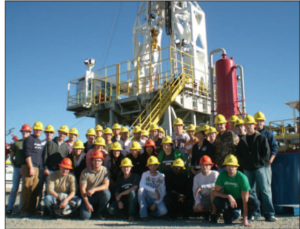
2008 EM student field trip

At the fourth annual meeting of the AAPL in New Orleans in June 1958, the education committee passed a resolution stating: "... be it resolved that the American Association of Petroleum Landmen extends to the University of Oklahoma its hearty congratulations in that this university is the first college or university in the United States to offer a fully accredited course of (landman) training. ... This Association offers to the University of Oklahoma its full cooperation and agrees to assist in any way, where it is possible to do so."