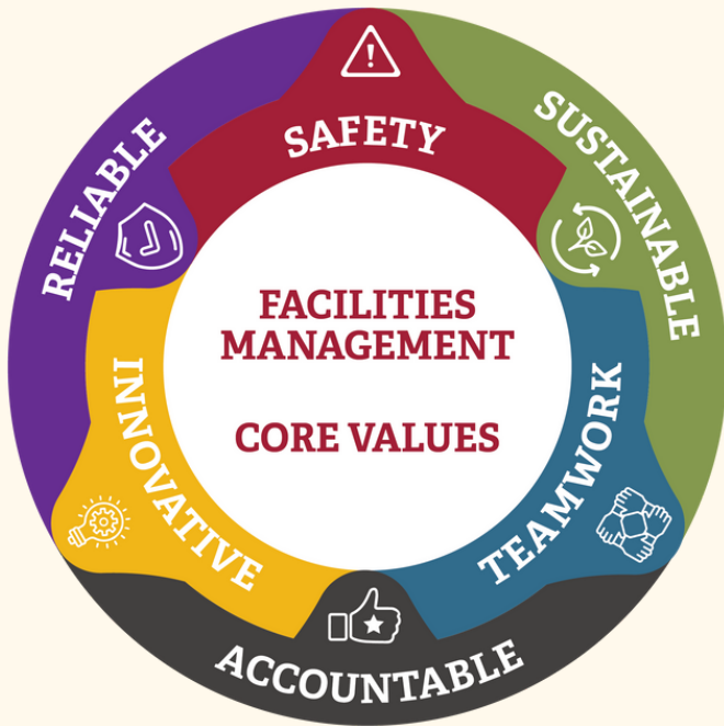
Pictured: OU FM Core Values logo designed by OU Printing Services.