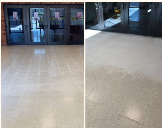
Left Picture: Entryway and floor prior to stripping wax. Right Picture: Half of entryway completely stripped of wax.

OUFM's Custodial Services stripped and waxed the entryway to Mosier/Everest over the summer. Pictures below highlight the differences in floor quality during the stripping process.