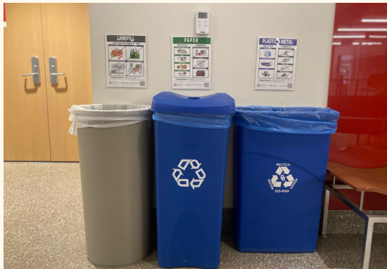
Pictured: Signage and infrastructure located on the first floor of Gallogly Hall.

OUFM's Sustainability division designed and posted educational signage in over 3 million square feet of campus facilities. The project aims to increase volume of collected recycling materials, reduce contamination, and ultimately make it easier to access recycling infrastructure.