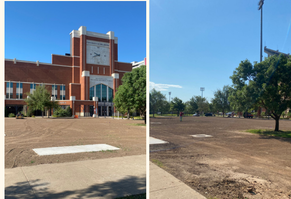
Pictured: Work in progress for the project north of the stadium.