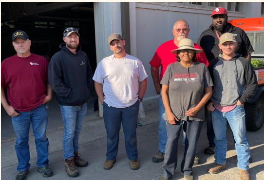
Pictured: Landscape Advisory Council Members