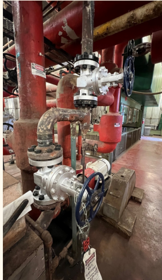
Pictured: Turbine Pump Isolation Valves