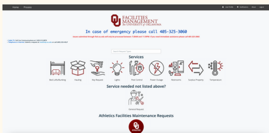
Submit a service request at FixIt.OU.edu .

The campus community will now experience more transparency from service requests than ever before with the new service request feature: FixIt.OU.edu! FixIt is the new online platform for submitting service requests at the University of Oklahoma. The feature assigns each individual request an identification number and delivers live updates right to the user's inbox. FM Team Members can also submit service requests or look at floor plan.