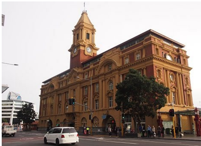
Figure 1. Edifice of Auckland Ferry Building, Photograph by Engineering New Zealand, "Auckland Ferry Terminal from the Corner of Queens Street," from Engineering New Zealand, "Auckland Ferry Terminal Building," Our Work, accessed July 3, 2019. https://www.engineeringnz.org/our-work/heritage/heritage-records/auckland-ferry-terminal-building/ .

Illustrations should be placed as close as possible to their first mention in the text—either immediately following the paragraph in which they are mentioned or immediately before them—on the same page or the page following. 24 Illustrations should be labeled and captioned below the image, with a single blank line of space between the image and its caption and one or two blank lines of space following the caption. These captions should be single-spaced and left-aligned, using the same typeface as your paper’s main text with either the same or a slightly smaller font size. 25 Figure 3 shows an example illustration with a full caption, including a description of the image and credit line.