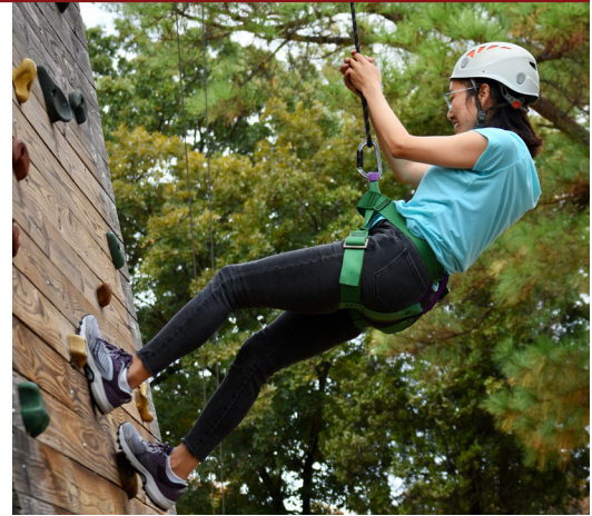
Student at Leadership Retreat.

3 Enjoy additional leadership development opportunities, including professional networking, leadership coaching, and events with employers and executives. Students can begin participating as HLAs early in the sophomore year. The application opens during the spring semester.