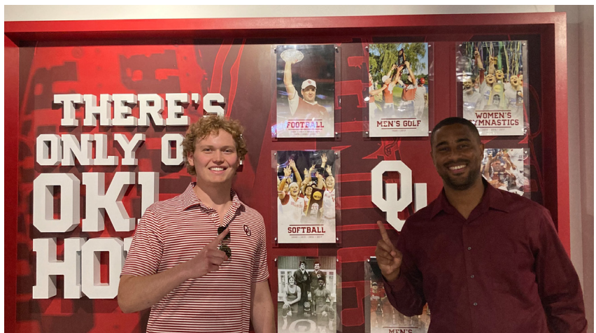
Mentor and mentee.

(405) 325-3164 Rawl Engineering Practice Facility, Rm. 260 www.ou.edu/coe/leadership For general questions: goengineering@ou.edu