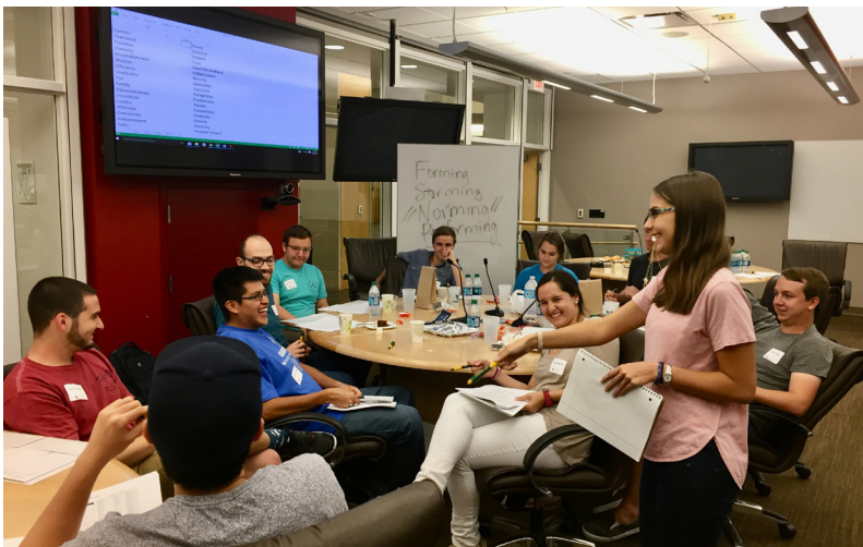
Students participating in a retreat activity.

5 The Certificate in Engineering Leadership, available only to undergraduate students in the Gallogly and Mewbourne colleges, allows you to design a leadership development experience that suits your interests. Courses include ENGR 4013: Leadership & Management for Engineers, and a broad selection of electives in humanities, social sciences, engineering and business. The 15-credit-hour program is similar to a minor, and completion will be reflected on your transcript.