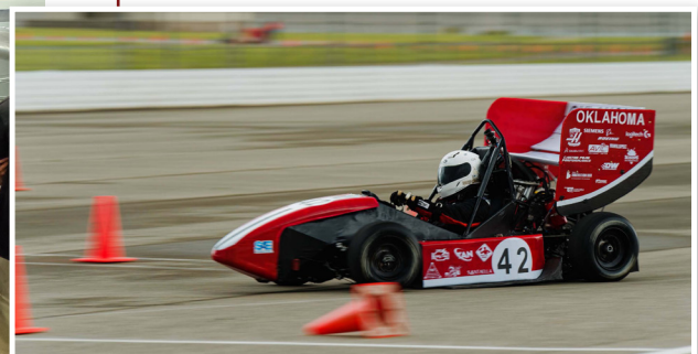
Sooner Racing Team (SRT) competing at the 2024 SAE International Formula SAE event in Jackson, Michigan. SRT finished 6th in acceleration out of 76 teams.

NASA Houston, TX Aerospace Engineer Blue Origin Harvest, AL Manufacturing Engineer SpaceX McGregor, TX Test Engineer for Upper Stage Tesla Fremont, CA Associate Manufacturing Equipment Engineer Boeing Oklahoma City, OK Mechanical Reliability Engineer