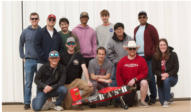
The OU Design/Build/Fly (DBF) team with their meticulously crafted aircraft; the team placed 17th in the 28th Annual Design/Build/Fly AIAA competition.

“The School of Aerospace and Mechanical Engineering not only provides an excellent education but also fosters a strong sense of community. The professors and staff are highly approachable, and their dedication to students’ success is evident. Additionally, the student body has created a close-knit, family-like environment.”