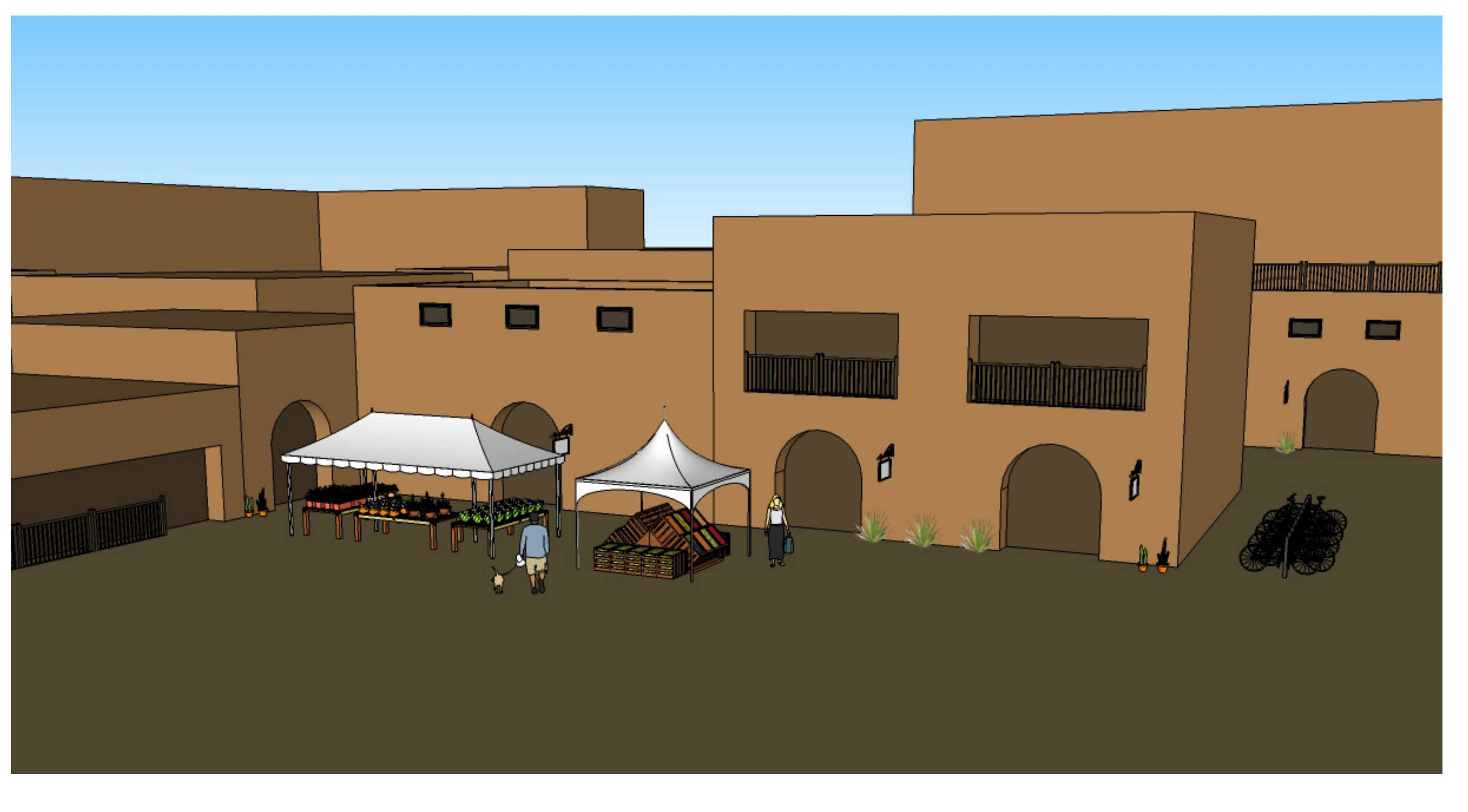
The above perspective sketch portrays the market square. Adobe buildings are highly sustainable because of their ability to retain both warm and cold temperatures. In the desert where temperature fluctuations can be extreme adobe is an excellent construction material. Constructing buildings from adobe also creates a local economy, instead of using imported materials such as steel, which would be manufactured somewhere else. The market square is bustling with activity as it is the central heart of Roussette. The market not only provides citizens with goods, it also provides a livelihood for the local farmers who do not have to export their crops for income. Bicycle racks adorn the market as cycling, along with walking, is the main mode of transportation in Roussette. The market is a gathering place for the citizens of Roussette. It promotes community interaction, and kinship.